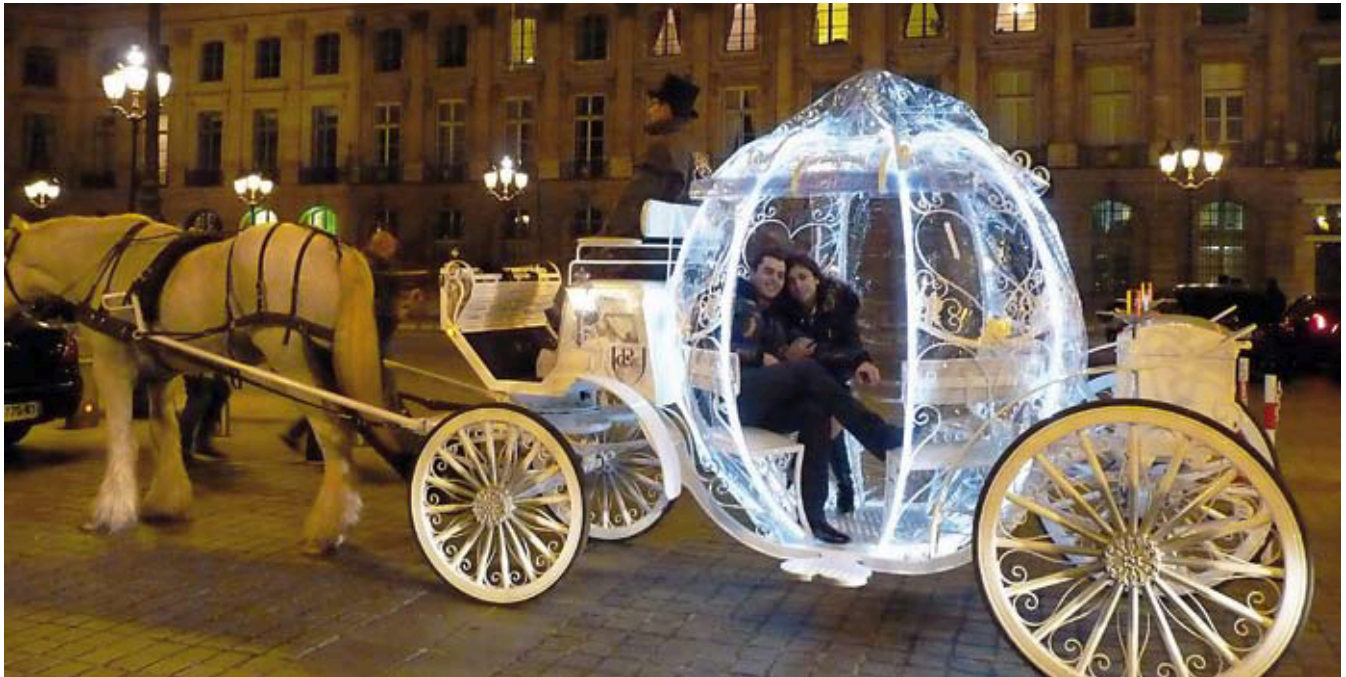
Surprise your loved one with a horse and carriage ride beneath Parisian lights